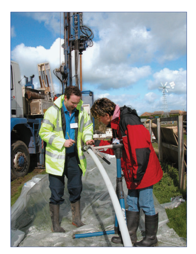
Construction of CMT ports in a 7-Channel system installed in Silsoe, England.

Two systems are available. The 1.7" (43 mm) OD polyethylene tubing, segmented into seven channels, allows groundwater monitoring at up to 7 depth-discrete zones. The 3-Channel System uses the same material and construction, but it is only 1.1" (28 mm) in diameter. This narrow tube was developed for smaller diameter installations, especially direct push where the annulus for seal placement is narrow.