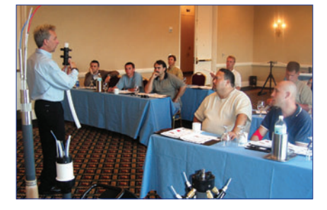
Instructing drilling contractors and consultants on CMT installation techniques at Battelle Bio-Symposium, Baltimore, Maryland.

Please contact Solinst should you wish to attend or set up a training session.