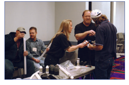
The first CMT contractor training course, conducted at the NGWA Expo in Las Vegas, December 2004. Contractors are being instructed on proper port construction.