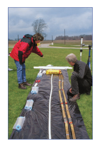
Installation of a 3-Channel CMT System with bentonite and sand cartridges. Three zones were monitored over a 20 ft (6 m) depth. The installation was completed in glacial till at the University of Waterloo, Ontario Canada.