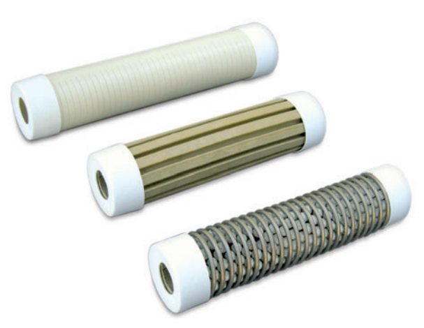
3-channel CMT Sand and Bentonite Cartridges

The CMT can be installed using standard sand and bentonite layers placed via a tremie pipe, or poured directly from the surface. The Model 103 Tag Line is ideal for accurate placement of sand and bentonite during borehole completion. If the installation is in loose sands, natural collapse can be used, allowing the sand to collapse around the tubing.