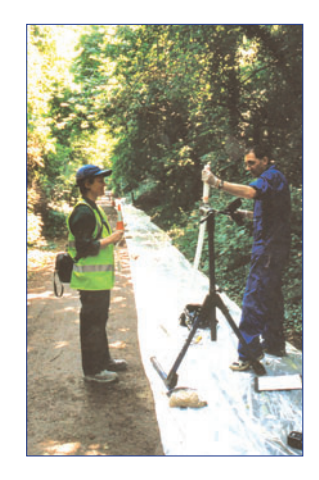
CMT System installed to a 60 m (200 ft) depth with seven monitoring zones. Installation was completed by placing layers of sand and bentonite to monitor a BTEX/MTBE plume in a Chalk aquifer, United Kingdom.