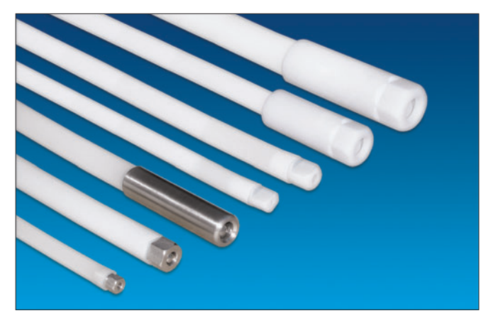
From left to right: SS10, SS16, SS19, D13, D16, D25 and D32 Waterra Pumps