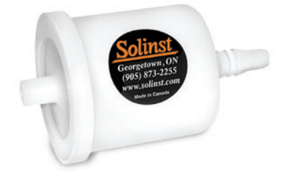
Model 860 Disposable Filter

These filters can also be used with most other Solinst sampling devices. (See Solinst Model 860 Data Sheet.)