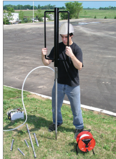
Installing Piezometers with a Manual Slide Hammer

Solinst Drive-Point Piezometers can be driven into the ground with any direct push or drilling technology, including the Manual Slide Hammer shown at right. To avoid clogging or smearing of the screen during installation, a shielded version is also available.